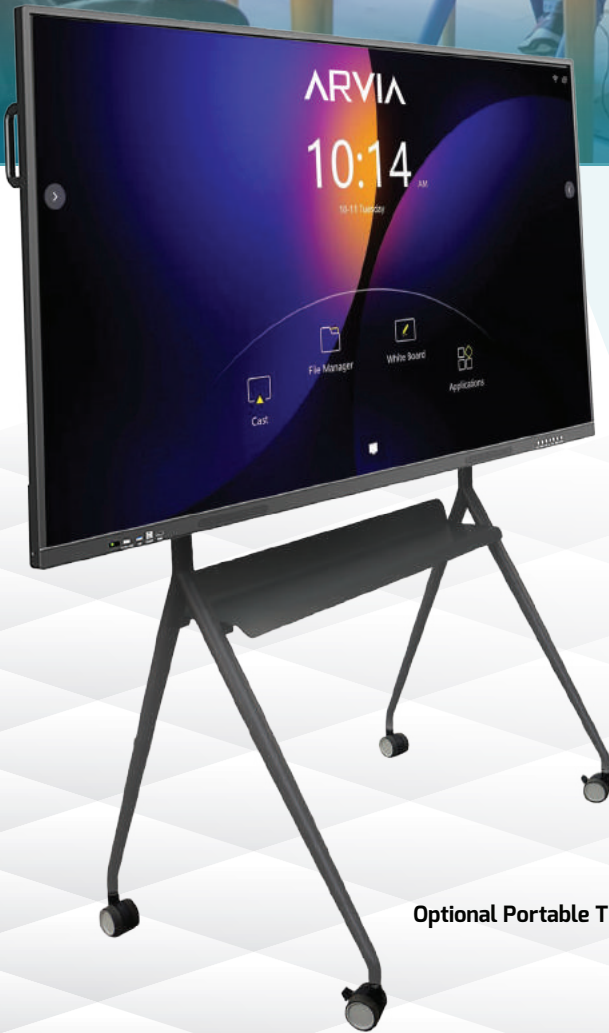
Optional Portable TV Stand

All in one Android-based Smartboard ARV200 Series : Sizes 65", 75", 86"